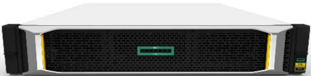
HPE MSA 2052 SAN Storage