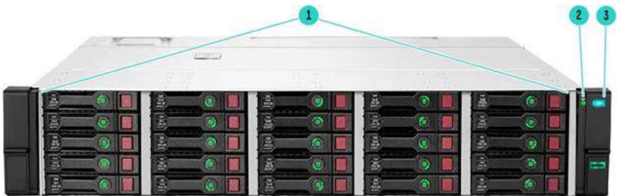
HPE D3710 Enclosure (SFF)

See the Windows Server Catalog for the latest supported configurations. Total support can grow as needed to up to 96 LFF drives or 200 SFF drives.