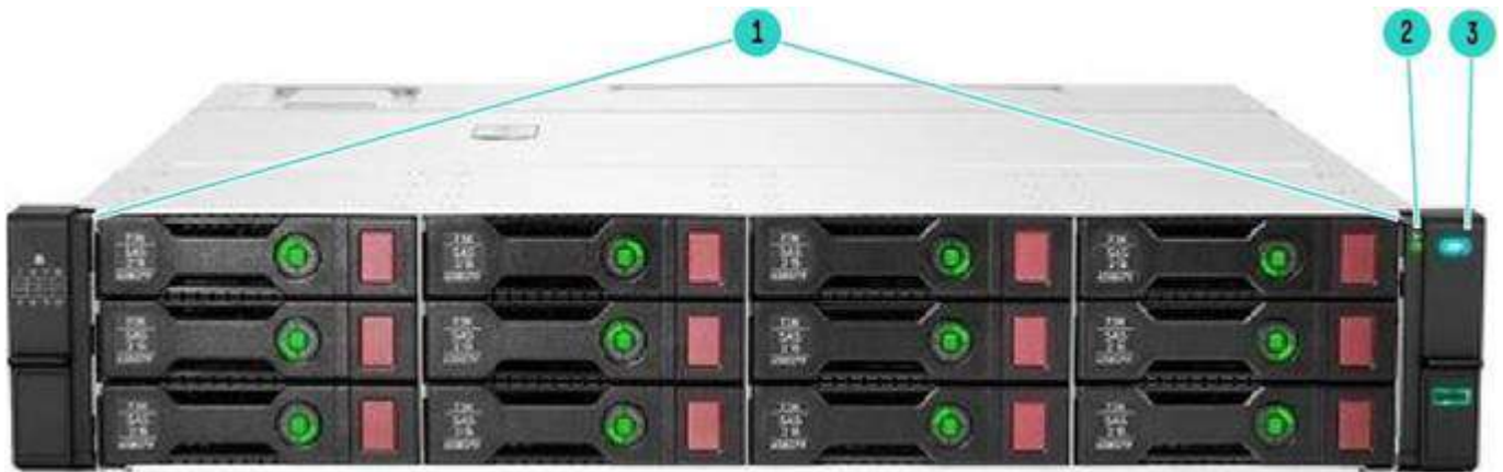
HPE D3610 Enclosure (LFF)