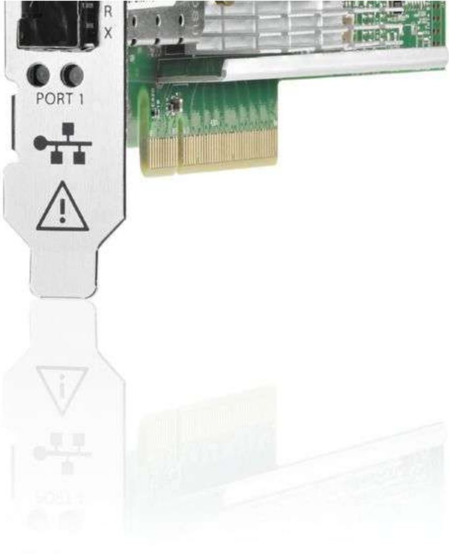
HPE Ethernet 10Gb 2-port 530SFP+ Adapter, with full-height bracket